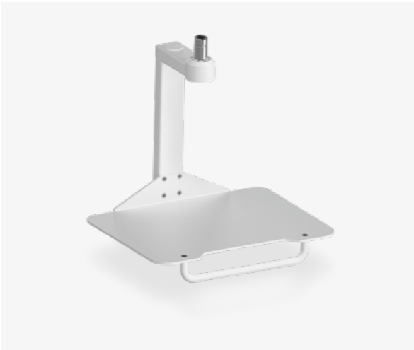
80-001158 Equipment support plate up to 8 kg 80-001348 Equipment support plate up to 15 kg