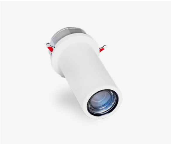
80-001399 4K camera system (wireless) 80-000880 HD camera system (wireless) 80-000705 HD camera system (wired)