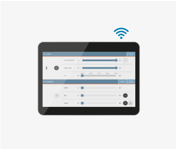
80-000396 Wireless wall control