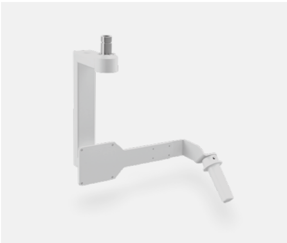
80-000767 Monitor holder, single