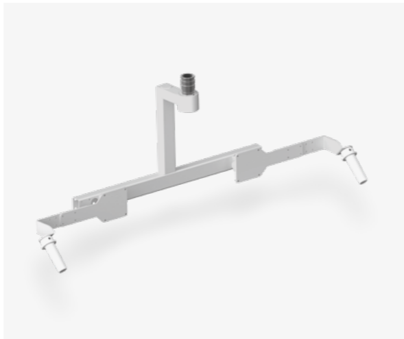
80-000777 Monitor holder, double