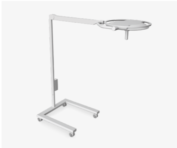
80-000506 Mobile stand for evoLight 500 / 500+ / 600 / 600+