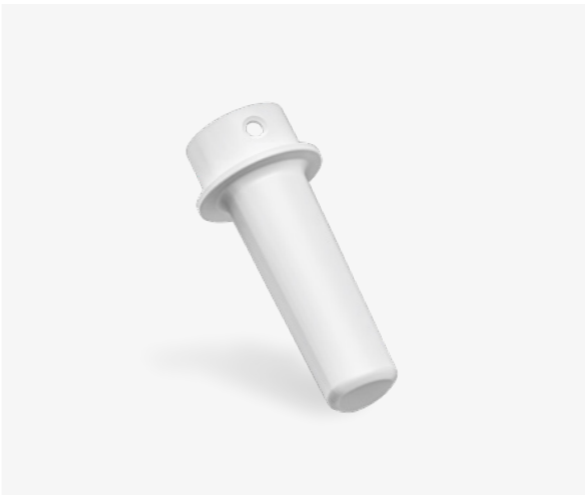
80-000183 Sterile handle 80-000771 Sterile handle for camera (wireless) 80-000611 Sterile handle for camera (wired) 80-020134 Devon adapter 80-020135 VMP adapter