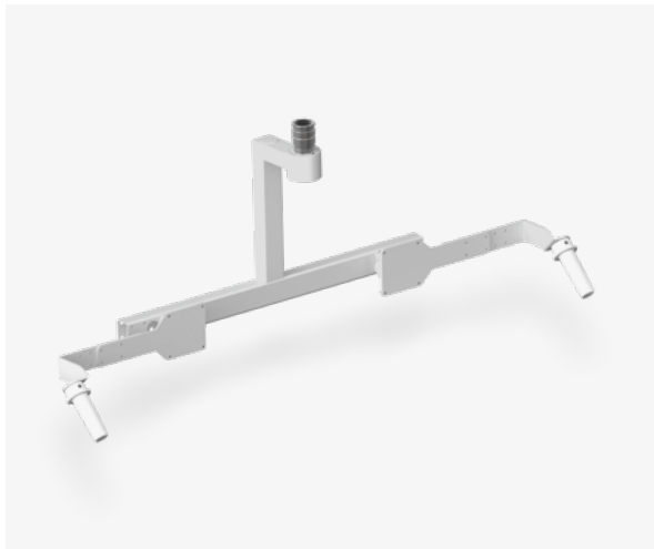
80-000777 Monitor holder, double