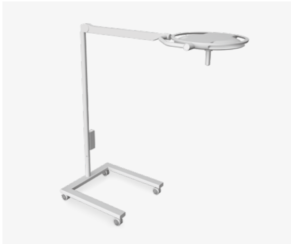
80-000506 Mobile stand for evoLight 500 / 500+ / 600 / 600+