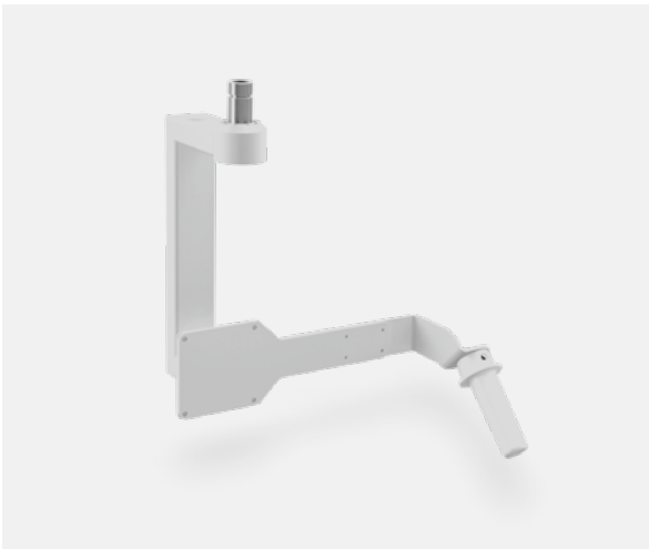
80-000767 Monitor holder, single