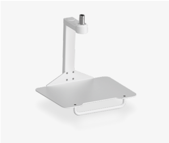
80-001158 Equipment support plate up to 8 kg 80-001348 Equipment support plate up to 15 kg