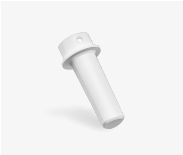
80-000183 Sterile handle 80-000771 Sterile handle for camera (wireless) 80-000611 Sterile handle for camera (wired) 80-020134 Devon adapter 80-020135 VMP adapter