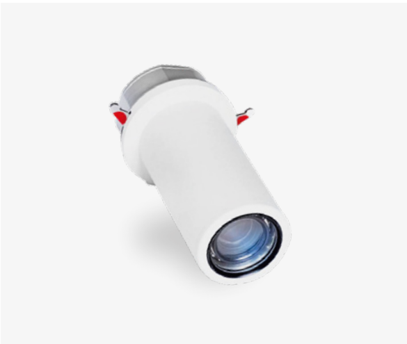
80-001399 4K camera system (wireless) 80-000880 HD camera system (wireless) 80-000705 HD camera system (wired)