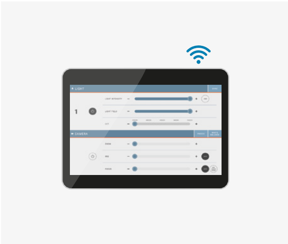
80-000396 Wireless wall control